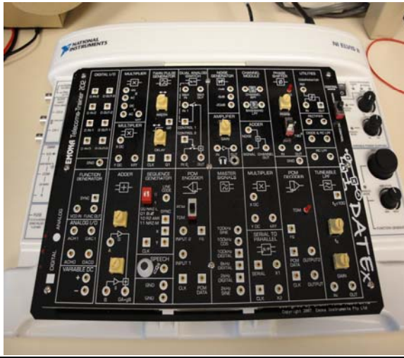
Figure 1: Emona DATEX-ELVIS II communications bundle

In order to perform communications experiments using the ELVIS II-DATEX setup given in Figure 1 in a remote laboratory environment, there is a need for eliminating the user interface needed to perform the required connections for the DATEX modules.